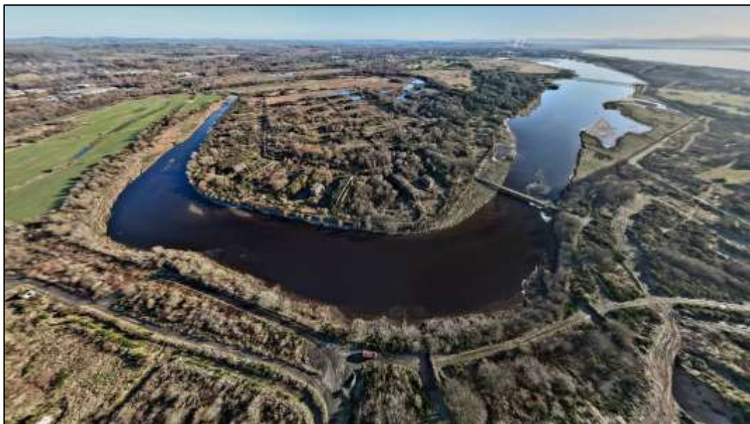
Drone photography of Longford Misk