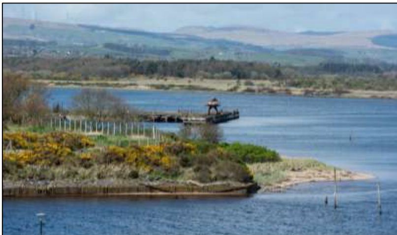
Looking across to the Bogside flats.

Further down from the wharf, is the story's end, with the confluence of the River Garnock (flowing down from the left), and the River Irvine (in the foreground). As one, they flow under The Big Idea bridge and out to sea.