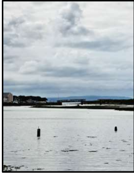
Confluence of Irvine & Garnock Rivers

A SEQUEL TO: HIDDEN HISTORY OF THE RIVER GARNOCK FROM THE SWALLOW HOLE TO THE LUGTON MOU' PUBLISHED 2023