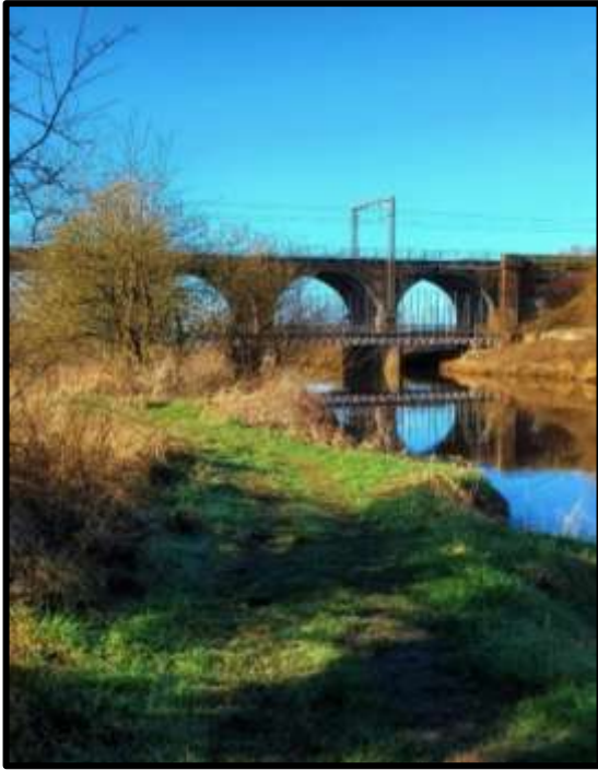
Longford Viaduct