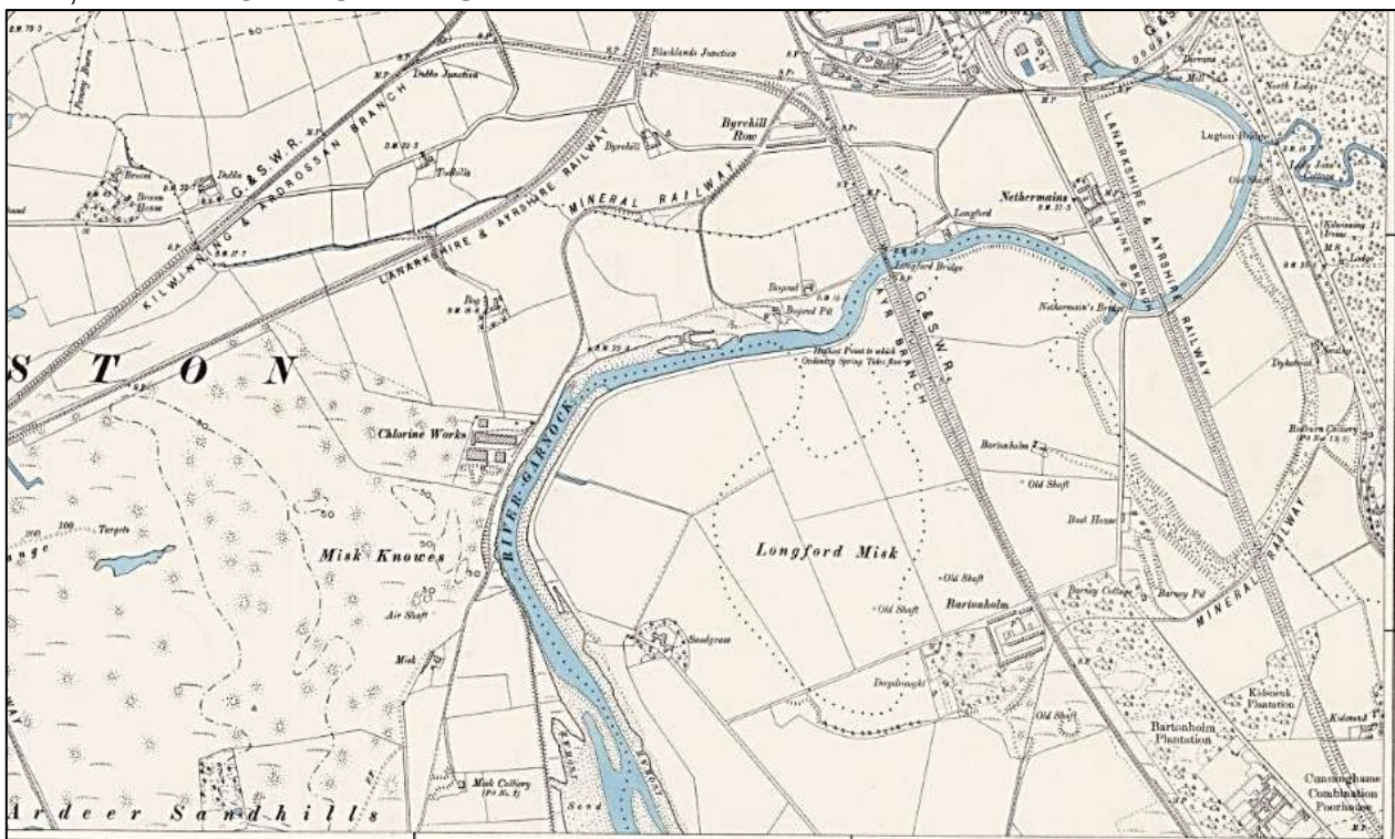
Ayrshire Sheet XVI.NE 1897

From the Longford Viaduct (the rail track labelled G&SWR on the 1897 map below), the Garnock is flanked on one side by Stevenston and Ardeer, known as GARNOCK WEST and the other side by Irvine, known as GARNOCK EAST .